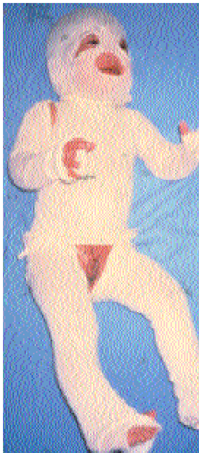
Fig. 3. Wet-wrap treatment of a baby.

• Topical steroids. For acute flares, we recommend the use of 1% hydrocortisone acetate to the face and neck and topical betamethasone to the body as well as wet wraps 7 (we use two layers of cotton tubular bandage as a dressing, a wet (damp — warm water) layer underneath and a dry layer on top) for up to a maximum of 5 days (see Figs 3 and 4). It is important to continue with the liberal use of moisturiser. The use of wet wraps may be continued even without topical corticosteroids (i.e. with moisturiser alone). The advantages of wet wraps include increased contact with the skin during treatment (topical steroid is not rubbed off onto bed linen), and reduction of the skin temperature — thus reducing warmth, sweating and itch and indirectly improving sleep.