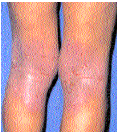
Fig. 2. Typical flexural involvement.

After the age of 2 years the skin lesions tend to have a predilection for the folds, especially the antecubital and popliteal fossae of the arms and legs, respectively (Fig. 2).