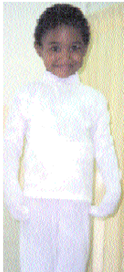
Fig. 4. Wet wraps in an older child. Note relative sparing of the face.

• Oil of evening primrose may be helpful, but more RCTs are needed to confirm the beneficial effects, particularly in view of the cost involved. Therefore oil of evening primrose is not routinely recommended in our centre but neither is it discouraged in the individual patient who inquires about its usefulness (discuss the insufficient evidence with the patient or parent).