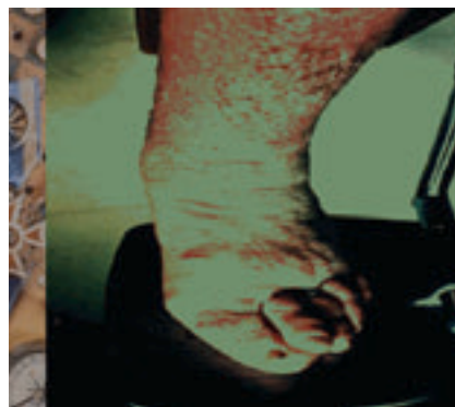
Fig. 1. Severe thyroid dermopathy.

There are a number of clinical features which are so specific to Graves' disease that diagnosis can be certain once hyperthyroidism is confirmed biochemically. These include: a diffusely enlarged thyroid gland with an obvious bruit, Graves' ophthalmopathy and thyroid dermopathy which consists of thickening of the skin, particularly the lower tibia, due to the accumulation of glycosaminoglycans (Fig. 1).