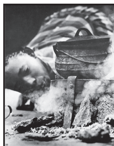
Fig. 2. Burning of BM fuels in an outdoor fire.

regions of the world, attention to the non-smoking causes of COPD is critical as part of the global strategy to combat this disease. For example, the WHO estimates that, although smoking is the leading cause of COPD, about 400 000 deaths per year occur from exposure to BM fuel pollution. Table I lists the non-smoking causes of COPD. This review presents evidence for non-smoking causes of COPD, discusses the pathophysiology of each of these causes, and emphasises the role of education in prevention of the disease.