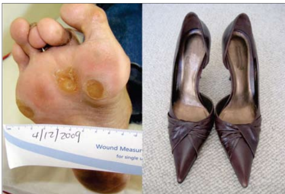
Fig. 2. Naughty and not-no-nice: inappropriate footwear for a neuropathic diabetic foot.

shins. Sensory symptoms are often worse at night and patients commonly find that moving, standing or walking alleviates the pain. 7 Loss of sensation is one of the strongest risk factors for ulceration. Patients are unable to detect trauma or discomfort and as a result wounds often go unnoticed and progressively deteriorate as the area is subjected to repetitive pressure and shear forces from walking and weight bearing. 6