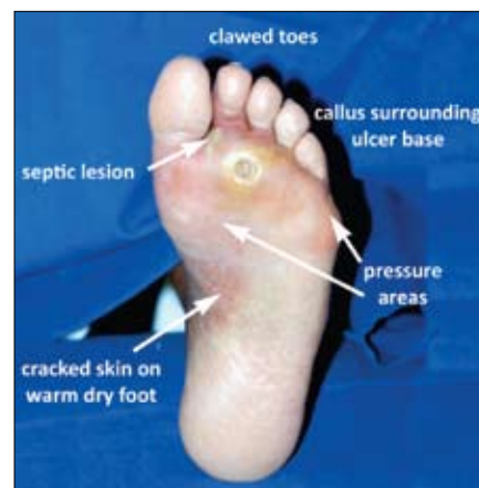
Fig. 3. Clinical features of a neuropathic foot.

usually kept tightly shut, dilate in cold weather to direct blood away from the surface of the skin back toward the central (core) part of the body. With autonomic dysfunction, the shunts dilate and blood bypasses the surface of the skin, causing a decrease in the integrity of the skin and aiding its becoming dry. The combination of poor natural lubrication and reduction in blood flow to the soles of the feet allows the skin to become dry and cracked, form fissures and become hard. 7 The clinical features of a neuropathic foot are shown in Fig. 3.