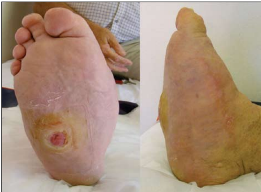
Fig. 5. Charcot's foot with rocker-bottom foot deformity and plantar ulcer.

at the edges of the foot from localised pressure damage, and gangrene may occur in addition to neuropathic complications. 2