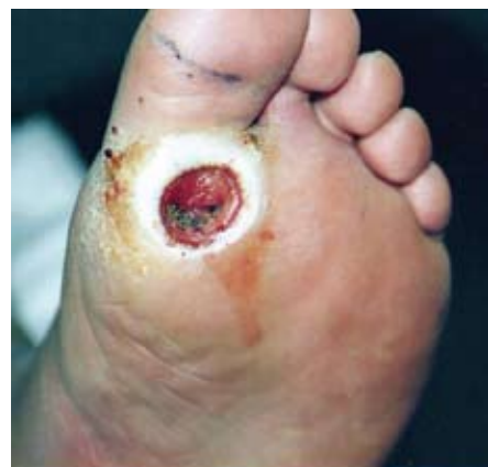
Fig. 4. Neuropathic ulcer.

In recognition of these various factors, there is international agreement and evidence that the most successful way to avoid foot complications in diabetes is by screening and regular foot examination. 1-4,7 There is less consensus on who should perform the examination. It can be performed by anyone who has been correctly trained and who has the basic equipment. The point to remember is that the purpose of the examination is to establish a level of risk for complications – the foot risk status – and act accordingly. 1-3,9 This examination, as part of another well-proven strategy – multidisciplinary team management of diabetes – has been shown