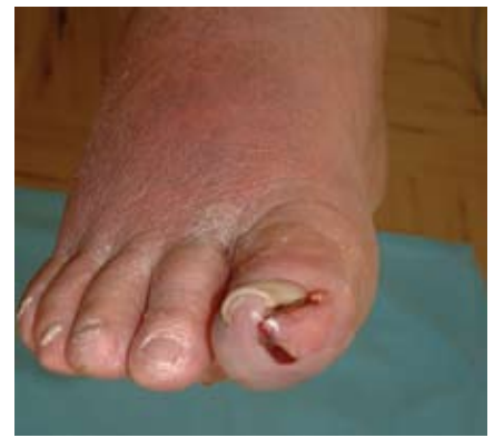
Fig. 2. Injury: cutting nail.

Another factor that is being increasingly recognised is the impact of psychological and behavioural issues on the diabetic foot. This could explain why some patients get repeat ulceration or fail to prevent ulceration in spite of being warned of their risk for ulceration. These changes to a patient's cognitive abilities appear to influence their ability to comprehend and therefore can reduce the effectiveness of foot health education. 3,6