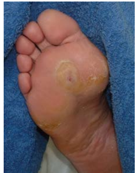
Fig. 3. Callus with early ulcer.