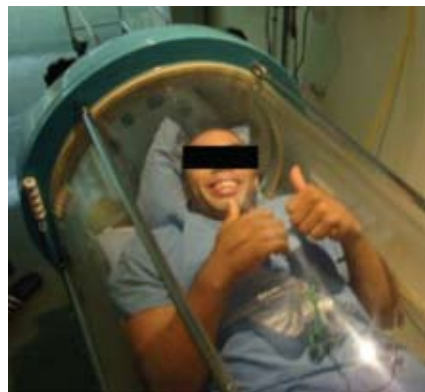
Fig. 3. Hyperbaric oxygen therapy.

Hyperbaric oxygen therapy involves inhaling 100% oxygen at increased pressure in a chamber designed specifically for this purpose (Fig. 3). In the patient with a diabetic foot ulcer, this results in reduced wound oedema, improved oxygen supply and improved bacterial defence. Numerous cohort studies and four randomised controlled trials have provided some evidence to suggest that systemic HBO_2 reduces the rate of major amputation in patients who have chronic foot ulcers as a complication of diabetes. The study reported by Abidia et al. 5 was the most robust and the only one which was blinded. It was based on a study population with severe peripheral arterial disease which was not amenable to revascularisation. The available evidence suggests that HBO_2 is of benefit for patients with diabetic foot ulcers with infection and/or ischaemia. In their review article Boulton et al. 6 cautioned that patients with neuropathic ulcers without infection or ischaemia have not been demonstrated to benefit from HBO_2 ( http://www.sauhma.co.za/ ).