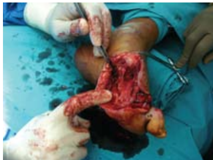
Fig. 2. Excision of plantar ulcer.

A single retrospective cohort study compared outcomes in patients admitted to hospital with extensive infection and who either did or did not undergo surgical