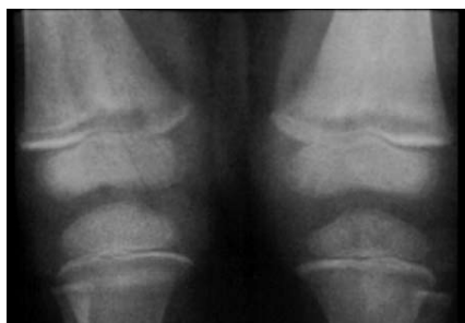
Fig. 3. Bone changes with acute leukaemia.

signs such as swelling, tenderness or redness must be further investigated and malignancies must be considered. In 20 - 30% of patients with leukaemia bone pain (Fig. 3) may be the presenting symptom, while up to 60% may have musculoskeletal symptoms or signs. Backache in children must be taken seriously as children seldom complain of it unless there is a reason, so that full evaluation for the possible cause must be undertaken. Spinal and vertebral tumours and bone infiltrations may all present with backache. Many tumours spread to the bone and can cause bone pain, including retinoblastoma, histiocytosis, rhabdomyosarcoma and neuroblastoma.