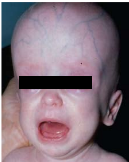
Fig. 6. Raised intracranial pressure.

These signs and symptoms are those essentially associated with raised intracranial pressure (Fig. 6). Headaches, although fairly common in children, are rarely caused by intracranial tumours. Any headache that is present for more than 2 weeks, is associated with early morning vomiting or co-ordination difficulties, needs to be further evaluated as a matter of urgency. Sudden onset of squints, ataxia and changes in behaviour may all be signs and symptoms of serious intracranial disease. Loss of milestones, enlarging head circumference associated with splaying of the sutures, sunset eye sign and prominent veins on the head may all be signs of raised intracranial pressure. These children need urgent and rapid evaluation by means of CT or MRI scans.