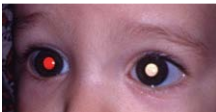
Fig. 7. Normal red reflex, leukocoria in the left eye due to retinoblastoma.

of concern and may be due to cataract or an underlying retinoblastoma and needs to be further evaluated (Fig. 7). Proptosis can be an early sign or symptom of orbital pathology that includes neuroblastoma, retinoblastoma, rhabdomyosarcoma, lymphoma and leukaemia, as well as a number of benign lesions. This obviously needs further urgent evaluation.