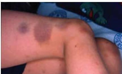
Fig. 2. Bruises associated with leukaemia.

These are worrying signs in children, especially if they occur together. There are many causes for anaemia and in malignant disease it is usually caused by bone marrow infiltration by abnormal cells (leukaemia, neuroblastoma and lymphoma) and may be due to excessive bleeding from the low platelet count that often accompanies bone marrow infiltration. Investigation of patients with anaemia and purpura (Fig. 2) often reveals multiple abnormalities on the full blood count. Bleeding is usually from the nose or persistent oozing from the gums but also includes skin bleeds. On occasions more catastrophic bleeds may occur, including intracranial bleeds. Any patient who has pallor and bleeding must have a full blood count performed to evaluate the haemoglobin, white cell count and platelet count. The most common diseases affecting the bone marrow are leukaemia, lymphoma and neuroblastoma.