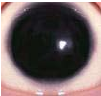
Fig. 1. Aniridia.

signs or symptoms and are difficult to diagnose. These signs and symptoms are not exclusive for malignancies but should alert the general practitioner to the possibility of a malignancy.