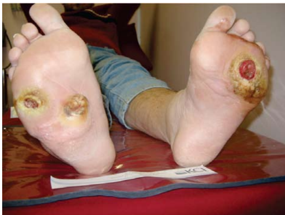
Fig. 2. Diabetic feet with all of the cardinal signs of deformity, callus formation and ulceration with infection.

Diabetic patients with compromised renal function or renal failure present a special challenge, both as far as preoperative or diagnostic angiography is concerned, and also with regard to complex interventional procedures such as remote arthroectomy, balloon angioplasty and stenting. The restriction of angiographic contrast volume is always of paramount importance in a diabetic patient undergoing any angiographic procedure, but withholding endovascular intervention when limb salvage is possible, is generally inappropriate and unnecessary. A transient rise in serum creatinine seldom leads to anuria or the need for haemodialysis. With appropriate pre- and post-intervention rehydration, plus the careful placement of interventional diagnostic catheters at the