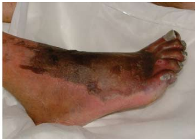
Fig. 1. Severe ischaemia in the toes of a diabetic with accompanying blistering and necrosis of the skin on the dorsum of the foot. Note the clawing and retraction of the toes with ulcer formation on the 4th and 5th toes.