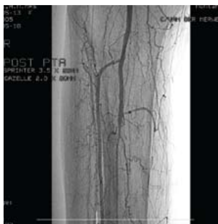
Fig. 4. After balloon angioplasty and stent the stenosis is no longer present.

The advantages of self-expanding stents in the lower limb include excellent crush resistance and extreme flexibility together with an optimal radial force.