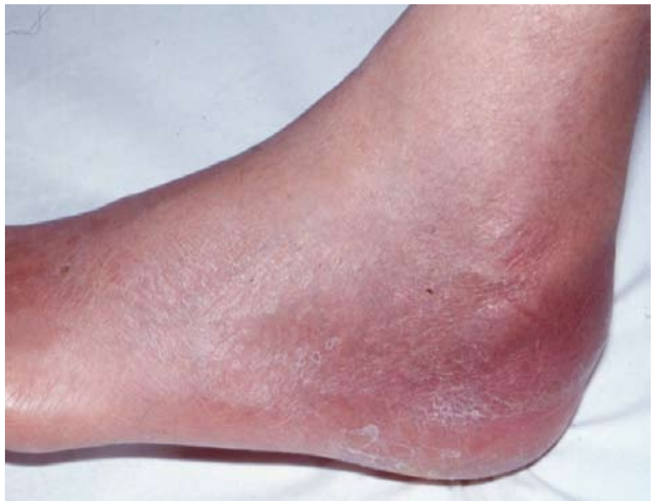
Fig. 4. Typical appearance of acute Charcot's osteoarthropathy on visual examination.

A less invasive test is available to aid in differentiating between the two diseases. Magnetic resonance imaging (MRI) provides exquisite anatomical detail of both soft tissue and bone, and may describe in more detail the nature of the bony