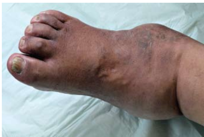
Fig. 1. Severe chronic destruction and deformity of the ankle because of unrecognised acute Charcot's osteoarthropathy.

Charcot's osteoarthropathy is a devastating, chronic, progressive destruction of bone and joint integrity affecting one or more peripheral articulations. It is characterised by joint dislocation, subluxations and pathological fractures in patients with peripheral neuropathy and results in a debilitating deformity, possibly leading to ulceration and amputation 1 (Fig. 1).