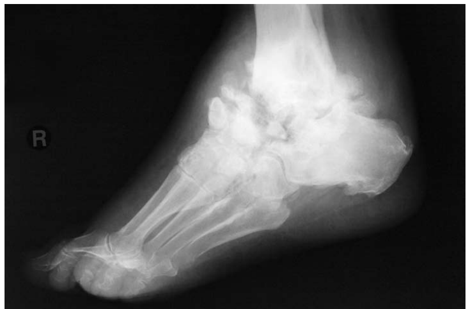
Fig. 5. Plain radiograph revealing chronic destructive effects of Charcot's osteoarthropathy in later stages. There may be no radiographic changes evident in the acute stages of the condition.