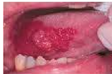
Fig. 2. Erythroplakia.

Erythroplakia (Fig. 2) describes any red mucosal lesion and is more likely to indicate a malignant lesion. These lesions should therefore always be biopsied and followed up closely to rule out malignancy.