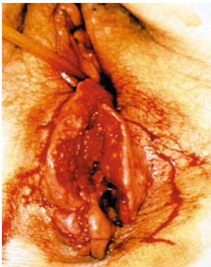
Fig. 6. Squamous carcinoma.

anal canal should be available to come to a final diagnosis.