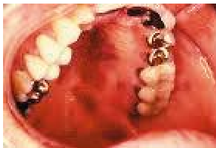
Fig. 4. Kaposi's sarcoma.

Kaposi's sarcoma usually presents on the skin, but the hard palate, gingiva, buccal mucosa and the dorsum of the tongue can also be involved (Fig. 4). Lesions present as red to purple raised plaques which can also ulcerate and cause pain and bleeding. Most of the time, mucosal lesions will accompany cutaneous lesions. Treatment consists of triple antiretroviral therapy and external beam radiation in collaboration with an oncologist.