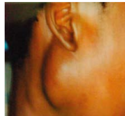
Fig. 6. DILS