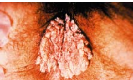
Fig. 3. Condylomata acuminata.

It may be necessary to perform proctosigmoidoscopy, either of the rigid or preferably of the flexible variety, to exclude or confirm the presence of associated rectosigmoid disease.