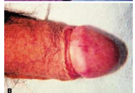
Fig. 6. Kaposi's sarcoma of the penis.

widespread in AIDS patients. 11 HIV-infected patients with molluscum contagiosum usually have a CD4 count of less than 250 cells/ \mu l. Molluscum contagiosum lesions may simulate more serious infections, such as cutaneous pneumocytosis, histoplasmosis and cryptococcosis, and should be confirmed by biopsy.