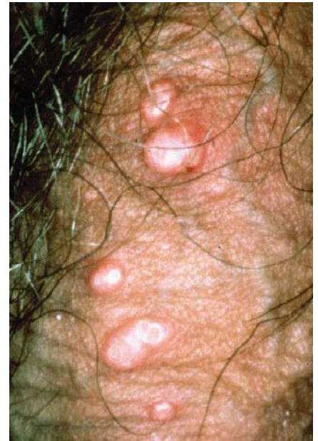
Fig. 4. Molluscum contagiosum on the penis.

It is caused by a sexually transmitted pox virus and is found in 10 - 20% of AIDS patients, most often on the face and genital areas. The lesions can become very large and