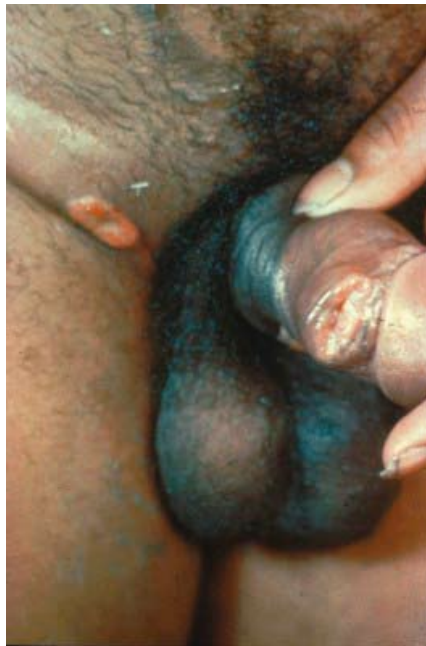
Fig. 3. Chancroid ( Haemophilus ducreyi ).