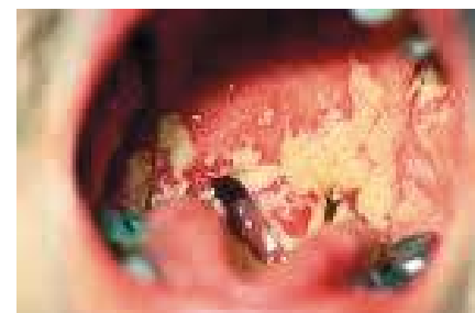
Fig. 3. Hyperplastic candidiasis.

These oral lesions can also be an indicator that candida is involving the oesophagus if accompanied by odynophagia and retrosternal pain. Oesophageal candida can be confirmed with gastroscopy. Treatment is with oral nystatin drops (only oral candida) or miconazole gel (Daktarin). Fluconazole 400