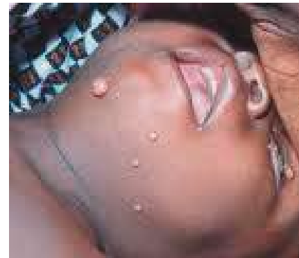
Fig. 5. Molluscum contagiosum.

to WHO staging of HIV/AIDS. 2 Patients complain of mildly tender, soft parotid swelling that can be unilateral or bilateral (Fig. 6). The pathophysiology behind this phenomenon is a diffuse lymphoid infiltrate, hence the name diffuse infiltrative lymphocytosis syndrome or DILS.