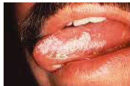
Fig. 1. Oral hairy leukoplakia.

is not easily removable (as is the case with candida). It has a hairy appearance and is most commonly located on the lateral border of the tongue. It can also involve the ventral tongue and in rare cases the buccal mucosa. Patients are usually asymptomatic and lesions can only be observed. If a lesion should show change, however, a biopsy should be done.