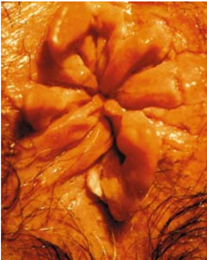
Fig. 2. Hypertrophied anal papillae.