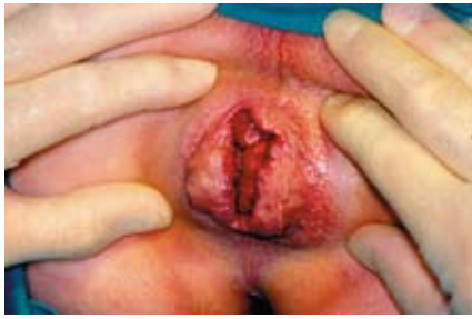
Fig. 4. Acute proctitis.

Appropriate special investigations such as MCS, histology and ultrasonography of the