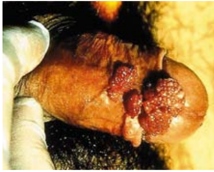
Fig. 1. Condylomata acuminata on the glans penis and foreskin.

Chancroid, caused by Haemophilus ducreyi , is a co-factor for HIV transmission. Chancroid in HIV-infected individuals may be resistant to standard regimens. Ulcers heal more slowly and prolonged courses of treatment may be needed.