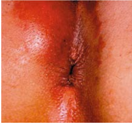
Fig. 1. Perineal abscess.

done. Look for pathology that should be expected, i.e. skin lesions, condylomata, abscesses and sepsis, proctitis, small perianal fistulas, fissures, infected thrombosed haemorrhoids and sphincter tone. Anal canal ulcers and multiple fissures may be missed, and associated rectal disease should be identified. In advanced destructive anal disease of fully fledged AIDS the findings may be confusing because of the presence of multiple pathology, and a descriptive clinical assessment should be made (Figs 1-6).