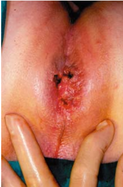
Fig. 5. Anal canal tissue breakdown.