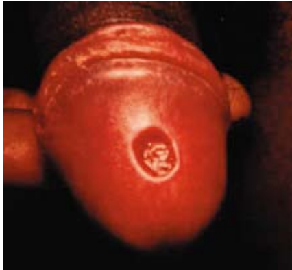
Fig. 2. Chancro caused by syphilis on the glans penis.