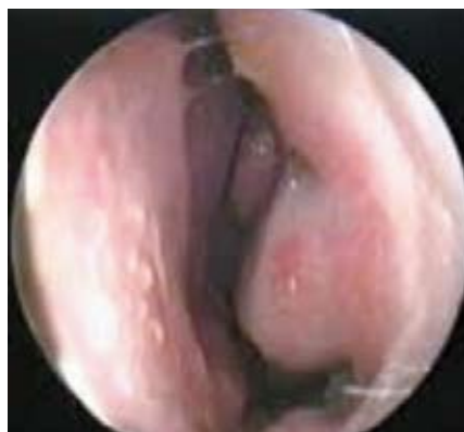
Fig. 3. Marked oedema and swelling of the inferior turbinates.

for since they are often under-diagnosed and untreated. A detailed environmental history must also be taken.