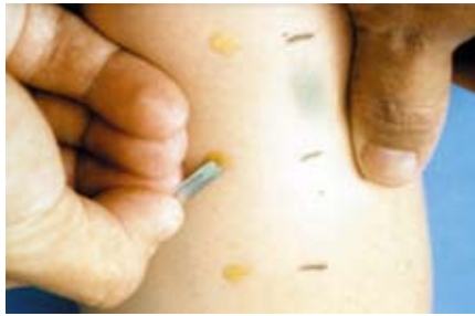
Fig. 4. Skin-prick test.

testing is inappropriate. The request for individual allergens on RAST testing must be based on the patient's indoor and outdoor environment as well the prevalent allergens in the patient's geographical area. This is why it is important to take a detailed environmental history.