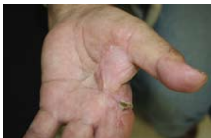
Fig. 3. Shotgun follow-up.

Wrist injuries are particularly troublesome as they can result in subtle fractures with disability. A scaphoid fracture (Fig. 4), the most common carpal bone fracture, can result in proximal bone non-healing because most (80%) of the blood supply is from a single vessel that begins distal to the proximal bone. It is likely this small twisted peanut-shaped bone is fractured at its 'waist' and will cause a non-union or even avascular necrosis. The scaphoid supports the trapezium outside the plane of the palm, which supports the first