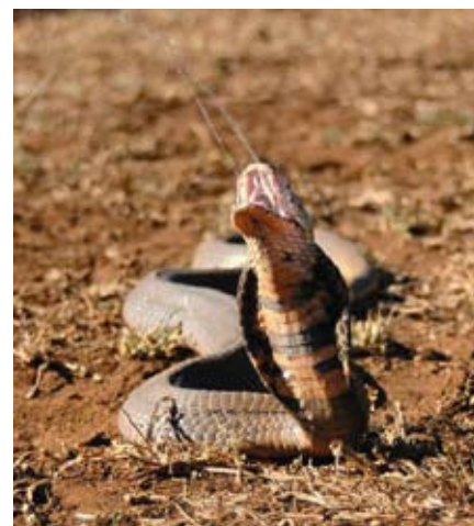
Mozambique spitting cobra.

and children for this purpose. If IV 'push' is used, antivenom should be injected slowly at a rate of no more than 5 ml per minute. In both cases, antivenom administration can easily be suspended if a reaction occurs, and then resumed once the reaction has been treated successfully.