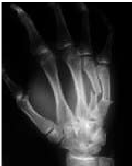
Fig. 1. Metacarpal fractures.

finger could not be salvaged but using available skin and soft tissue, a flap was mobilised to afford a functional hand despite the extensive injury (Fig. 3).