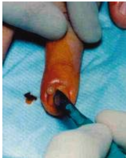
Fig. 7. Paronychia.

Hansen's disease is considered rare except in sub-Saharan Africa and India. The hallmark ulnar anaesthetic fingers and absorbed finger tips can progress to absent intrinsic muscles of the hand (interosseus and lumbricals), resulting in a 'claw hand'.