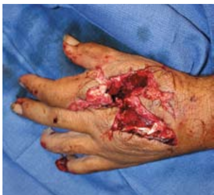
Fig. 2. Shotgun wound.