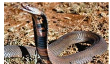
Mozambique spitting cobra.

cases polyvalent antivenom is the appropriate choice. The important exception follows bites by the boomslang, a slender, often arboreal, snake that causes significant coagulopathy, including internal and external haemorrhage, defibrination, thrombocytopenia, and widespread ecchymoses over a period of days (rather than hours). Selection of SAVP boomslang antivenom is indicated in such cases. This needs to be ordered from Pretoria and arrangements made to administer it in an ICU setting, which usually means transferring the patient to an urban centre, to which the antivenom can be sent.