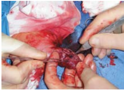
Fig. 6. Rattlesnake debridement.