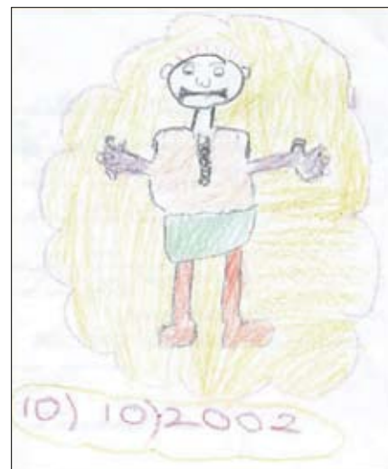
Fig. 2. Drawing by a child with tension-type headache.

Prophylactic therapy should be reserved for children with frequent headaches that interfere with daily lifestyle and result in functional disability. Prospective, randomised, controlled trials evaluating