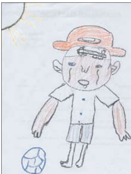
Fig. 1. Drawing by a child with migraine.

The aim of acute pharmacological treatment is a rapid return to normal function with minimal side-effects. 7 Ibuprofen 10 mg/kg/dose was shown to be superior to placebo 8,9 and equivalent to acetaminophen 15 mg/kg/dose in the management of migraine in children. 8 If non-steroidals are not effective, serotonin-receptor agonists are an option. Nasal sumatriptan 10 mg (20 - 39 kg) and 20 mg (>39 kg) has been shown to be effective in an 8 - 17-year age group, as was rizatriptan 5 mg (20 - 39 kg) and 10 mg