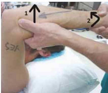
Fig. 2. Posterolateral rotatory drawer test. A distractive force is applied to the elbow (arrow 1) with the forearm in supination (arrow 2), while palpating the radial head to see if there is subluxation.

The patient lies supine with the shoulder flexed to 90°. The forearm is held in supination and the elbow is flexed between 45° and 90°. As with an anterior drawer test of the knee, the radius and ulna are distracted away from the distal humerus. The patient may feel apprehension or pain. The examiner's thumb over the radial head will feel the subluxation of the radial head. 5