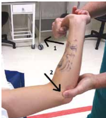
Fig. 1. Milk test. The patient's thumb is pulled radially to put stress on the MCL (arrow 1). The examiner's thumb is over the MCL while applying a valgus force (arrow 2). The elbow is taken through a full range of motion to elicit pain in the mid arc.

The milk test (Fig. 1) is the provocative test for the MCL; it is a modification of the moving valgus test. 4 The patient's thumb is held by the examiner, with the forearm in full supination while a valgus force is applied to the radial side of the elbow. The examiner's thumb feels the medial collateral ligament (just distal to the medial epicondyle) and the elbow is taken through full flexion and extension. The maximum pain is usually between 70° to 120° and usually disappears at 30° of extension as the olecranon enters into the fossa. Opening of the joint line may occur. Careful examination of the ulna nerve is necessary as this may also be irritated. Medial epicondylitis should be excluded.