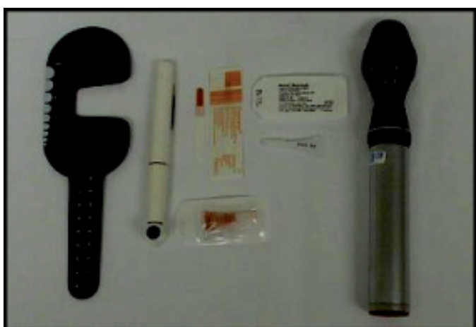
Fig. 1. Essential GP tools for eye examination.