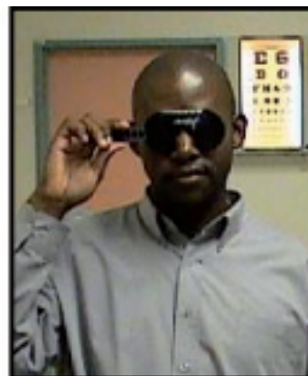
Fig. 3. Pinhole.