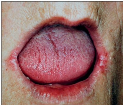
Fig. 1. Angular cheilitis. 'Common things occur commonly' and in the elderly population this is mostly as a result of an intra-oral Candida infection associated with the wearing of a denture.

Our general practitioners are minimally exposed to pathology of the oral cavity during their basic medical training. As a result, one can't expect them to be consistently effective in dealing with oral complaints. This might even extend to not being able to differentiate between healthy and diseased oral mucosa. Consequently, one often sees a prescription for a broad-spectrum topical or systemic antibiotic or a topical antifungal agent, anticipating that this approach will deal with the presenting signs and/or symptoms.