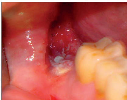
Fig. 3. An oral squamous cell carcinoma of the mandibular ridge behind the most posterior molar.

Dentists are equipped with skills and training to diagnose (including performing biopsies) and treat many basic oral mucosal lesions, and have been shown to successfully clinically diagnose 88.7% of oral lesions compared with 28% by medical doctors. 1 Furthermore, the emphasis of oral medicine training is very much on the early detection of pre-malignant lesions (white, red and combined white/red lesions) and