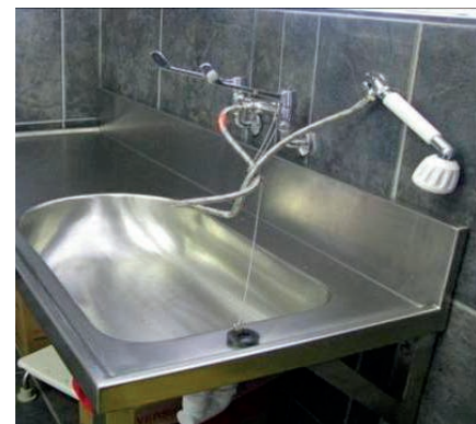
Fig. 4. Stainless steel basin and shower with surrounding dark porcelain tiles for hair washing in the day care treatment area. These prevent soiling and degradation of the facilities by topical therapies that stain fomites.

nurse training, which includes modules on wound care. Wound care facilities are provided at the clinic. A phototherapy unit has recently been donated to the centre, which will further reduce the need for local patients to travel to tertiary units.