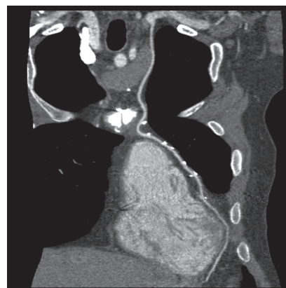
Fig. 3. Internal mammary artery bypass graft as seen on a MIP reconstruction.