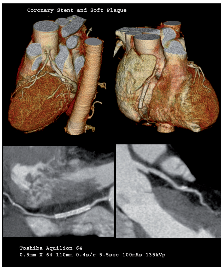
Fig. 4. Post-stent multislice CT evaluation.

Additional applications allow one to use cardiac CT to examine the heart and its chambers specifically, as well as to define left ventricular and right ventricular function, including: