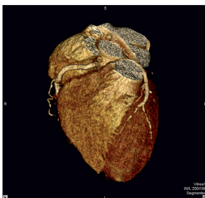
Fig. 2. Colour-coded 3D reconstruction of the heart.

the image slice the better the image quality. MDCT therefore improves spatial and temporal resolution.