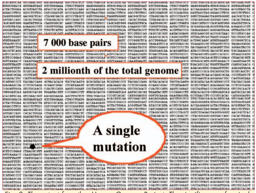
Fig. 2. The output from the Human Genome Project. The significance of a single base change is not readily apparent!

The genomic output from the HGP consists of no more than a very long sequence of 4 letters (A, C, T and G) in a very precise order. This complete sequence of more than 3 billion letters (the human genome) is stored in immense databases for further analyses (see the article by Dr George Rebello, p.30 of this issue). The challenge lies in determining what the sequence means when transcribed and translated into functional proteins. By far the majority (99.9%) of the sequence is not transcribed; it is in the remaining fraction of only 0.1% that most normal human variation lies, as well as the foundations of most genetic disease. An even larger challenge lies in determining the effects of alterations